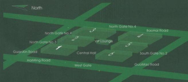
Layout of kunming fair